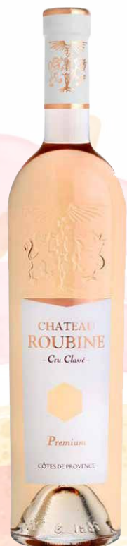
Roubine $39 Côtes de Provence Cru Classé "Premium" 18

The flagship wine of the Fayard family and benchmark for all other Cru Classés. A beautiful crisp mineral driven style with good weight and texture.