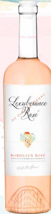
Clos Cantenac $40 Bordeaux "l'Exubérance" 18

Red summer berry fruit flavours marry with subtle notes of vanilla and caramel on the long silky finish. From the highly acclaimed St-Emilion Grand Cru Clos Cantenac.