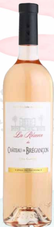
Brégançon $38 Côtes de Provence Cru Classé "Reserve" 18

An expressive nose of citrus fruits, red berries and exotic fruits, its mouth is silky and elegant. A stunning wine that redefines how good rosé can be.