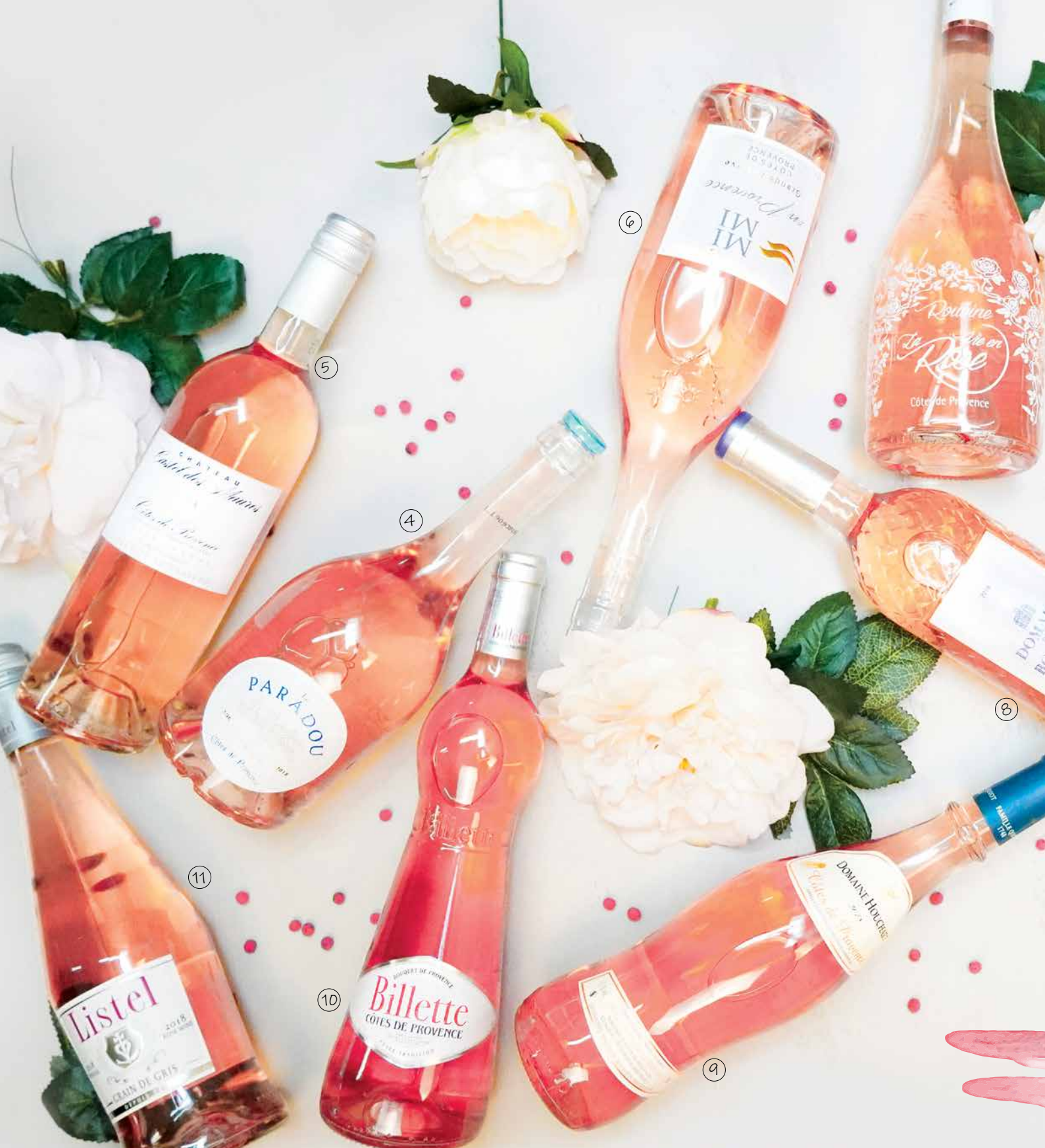
⑪ Listel $18 Sable de Camargue 18

THE #1 SELLING ROSE IN FRANCE! Also from the the world's largest organic vineyard, the Camargue. A pretty, pale pink. Light and dry, almost too quaffable.