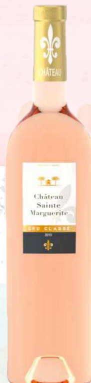
Ste Marguerite $38 Côtes de Provence Cru Classé 18

An expressive nose of citrus fruits, red berries and exotic fruits, its mouth is silky and elegant. A stunning wine that redefines how good rosé can be.