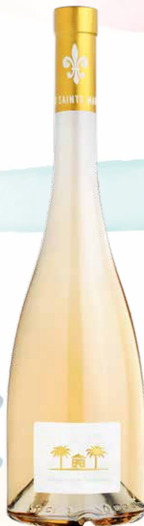
Ste Marguerite $48 Côtes de Provence Cru Classé "Symphonie" 18

This bright, sunny, salmon-coloured beauty is an elegantly crisp and well balanced Côtes de Provence rosé. If you ever get the chance, don't miss an opportunity to visit Château Roubine.