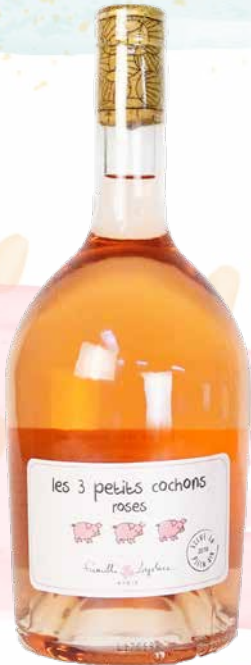
Aydie $23.50 South-West "3 petits cochons" 18

A blend of Tannat, Cabernet and Marselan. If the label doesn't get you, then the wine will. Everything a rosé should be – crisp, clean, dry, and quaffable.