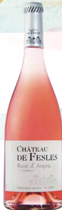
Fesles $21 Rosé d'Anjou 18

The Loire valley rosés from Anjou in an off-dry style have an enormous following. This has great texture in the mouth with abundant bright red fruits and a finish that just keeps on and on.