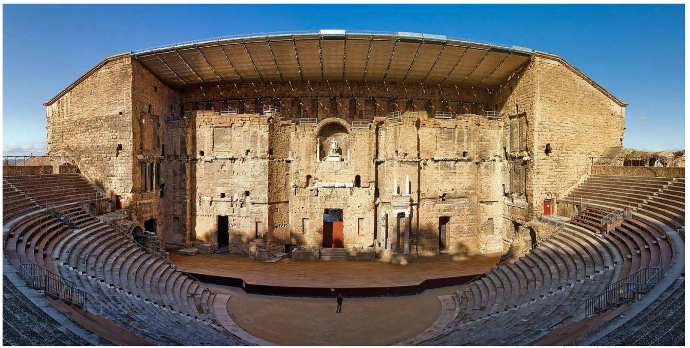
Orange's Roman theatre

It is one of the best preserved of all the Roman théâtre in France. It is the only building of its kind which still has its impressive acoustic stage wall: 103 metres long, 37 metres high, 1.80 metres thick. It hosts "The Chorégies d'Orange"—a magnificent summer opera festival held each year in August and one of the oldest festivals in France.