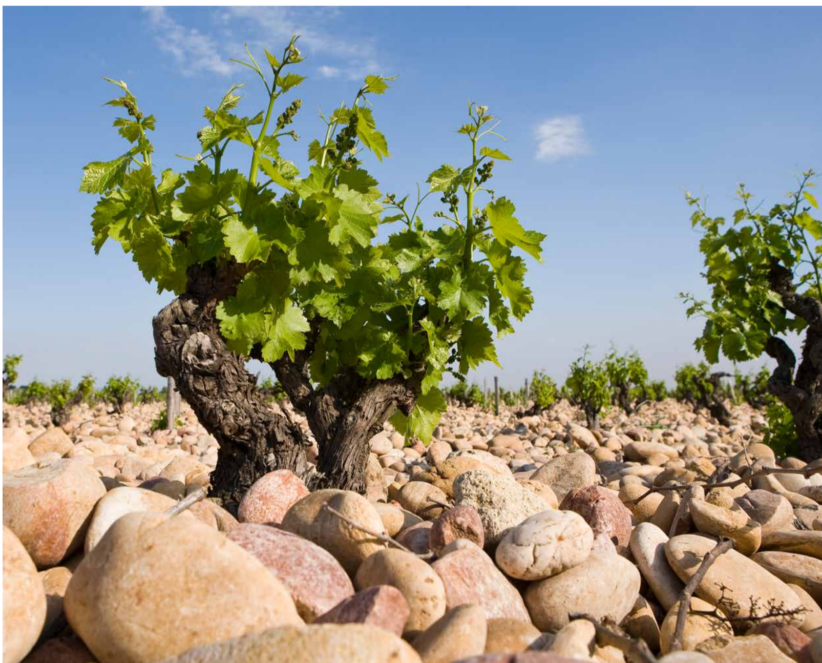
Typical "Terroir" of Châteauneuf du Pape