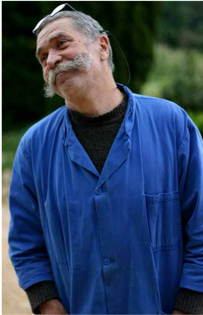
Serge Ferigoule - Domaine Sang des Cailloux