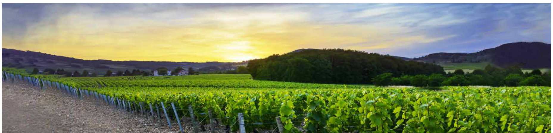
Côtes du Rhône vineyard

A fantastic expression of Grenache with deep raspberry and kirsch fruit, hints of olive tapenade, pepper, licorice and garrigue all showing on the nose. This is a full-bodied, fruit-loaded effort that has outstanding purity, loads of texture and a lengthy finish.