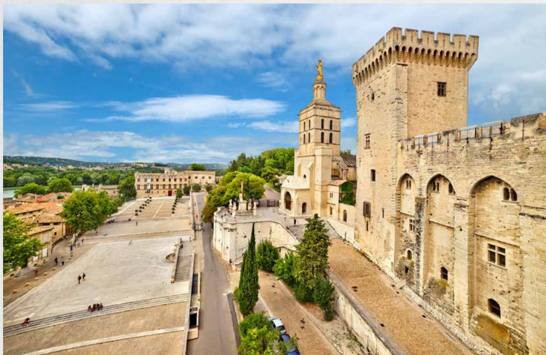
Palais des Papes

The first Christian communities quite naturally settled in the former Roman cities of Vaison-la-Romaine and Orange. Christianity would eventually spread throughout all of Europe, yet its heartbeat was strongest in the "Provence of the Popes".