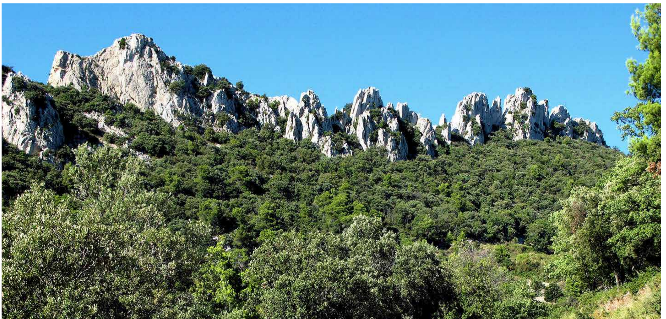
Dentelles de Montmirail