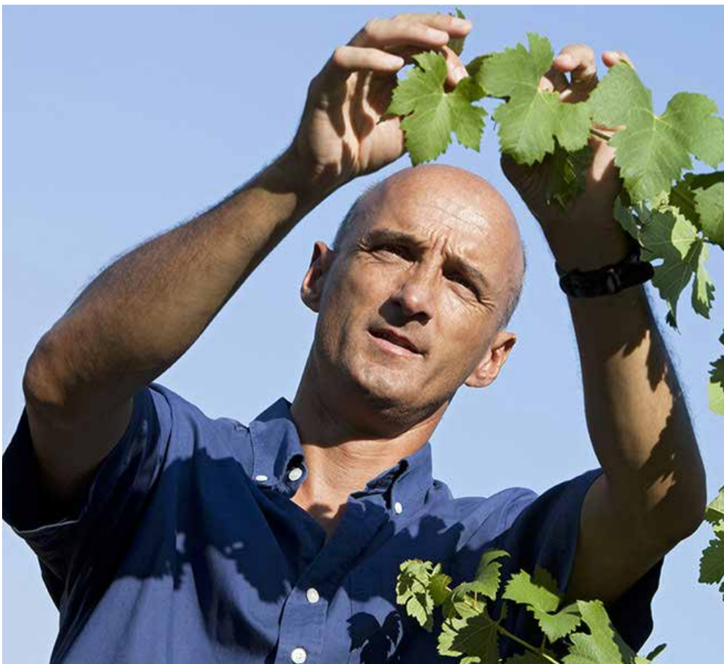
Worker at Senechaux

“... with aromas of gently toasted brioche, tangerine and lime. Plump, rich and silky on the palate, it’s wonderfully long and elegant on the finish.” 92-94/100 Vinous