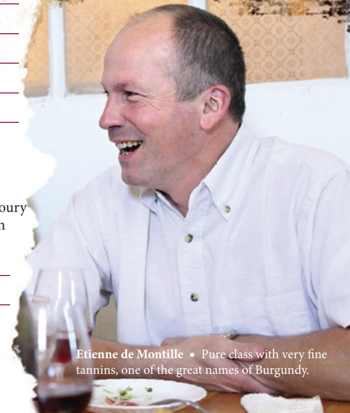
Etienne de Montille • Pure class with very fine tannins, one of the great names of Burgundy.